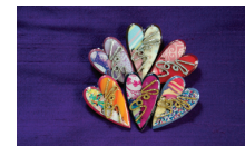
2009 LDSF design