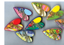
Assorted Heart Pins