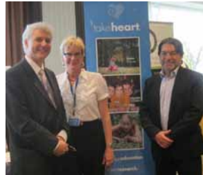
The LDSF - Canada made presentations and distributed materials at several medical conferences in Canada.

Our Canadian representatives also made presentations at the Pediatric Orthopedic Professionals (POP) seminar the Foundation where they had a booth and distributed 50 kits comprised of a medical presentation, a "Head-to-Toe" checklist and fact sheets. And at the University of Toronto's Genetic seminar where they distributed over 100 medical kits.